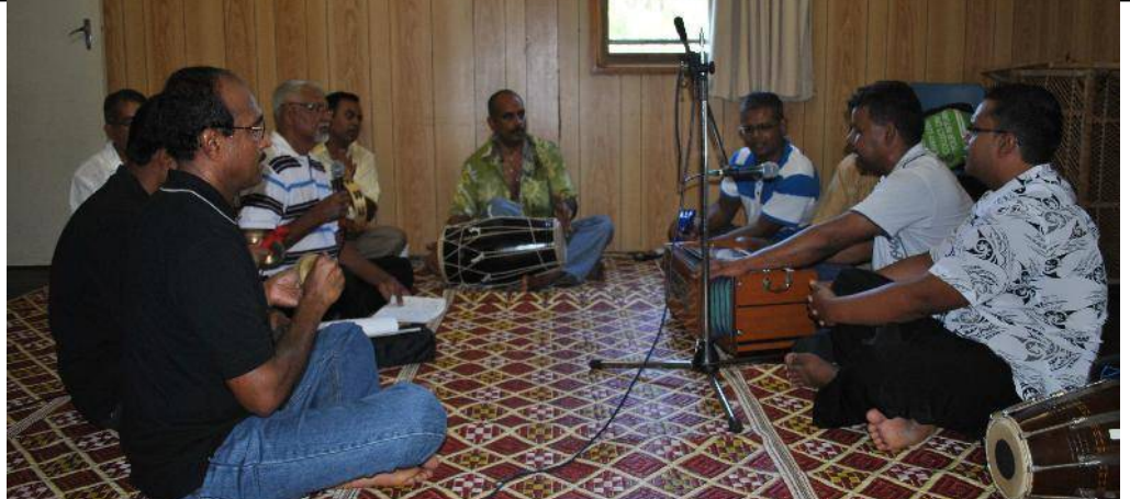
Members singing Chautal during Holi celebrations