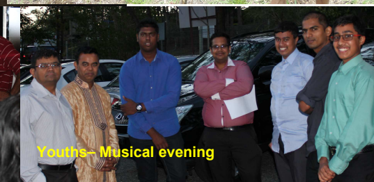
Youths- Musical evening