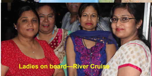
Ladies on board—River Cruise