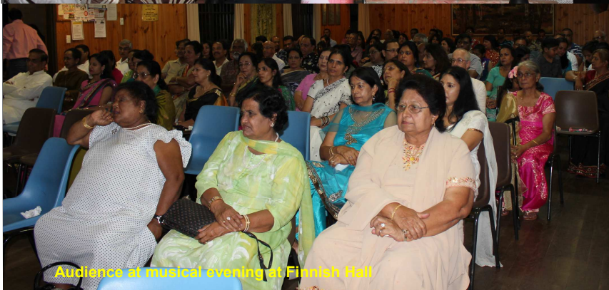
Audience at musical evening at Finnish Hall