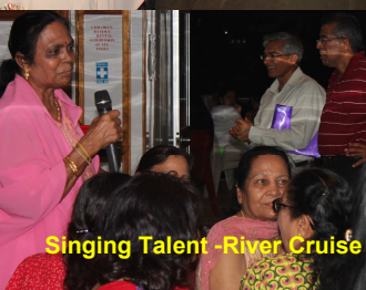
Singing Talent -River Cruise