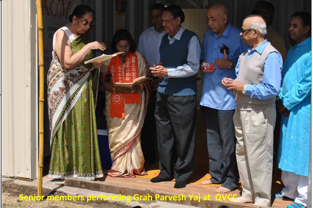
Senior members performing Grah Parvesh Yaj at QVCC